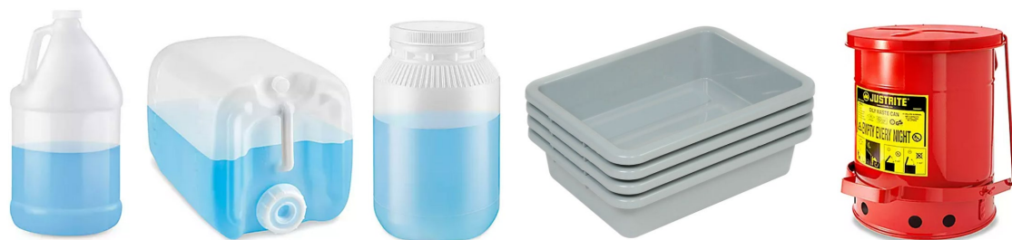
Left to Right: 4L bottle, 5-GAL carboy, 1-GAL widemouth jar, containment tray, paint rag can