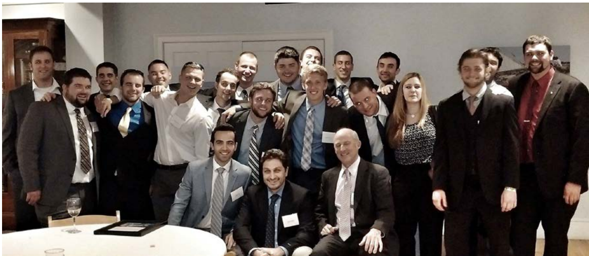
Image 4.0.1. Class of 2015 with some of the CM faculty at the 5 th Annual Alumni and Senior Banquet