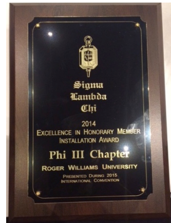
Image 4.0.3. SLC 2014 Excellence in Honorary Member Installation Award