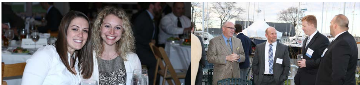
Image 4.3.1 Fifth CM Alumni & Senior Banquet – May 1, 2015 – Bristol Yacht Club, Bristol, RI

Alumni involvement on our CM Advisory Board and as members of our capstone review panel has been significantly growing in the past few years. The alumni subcommittee of our CM Advisory Board sponsored the fifth annual CM Alumni and Senior banquet on May 1 st (Image 4.3.1).